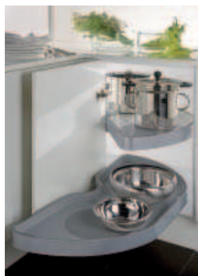
Functionality (Swivel direction right)